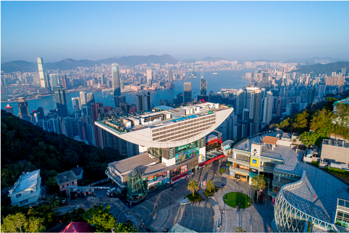
Sky Terrace 428 at The Peak Tower